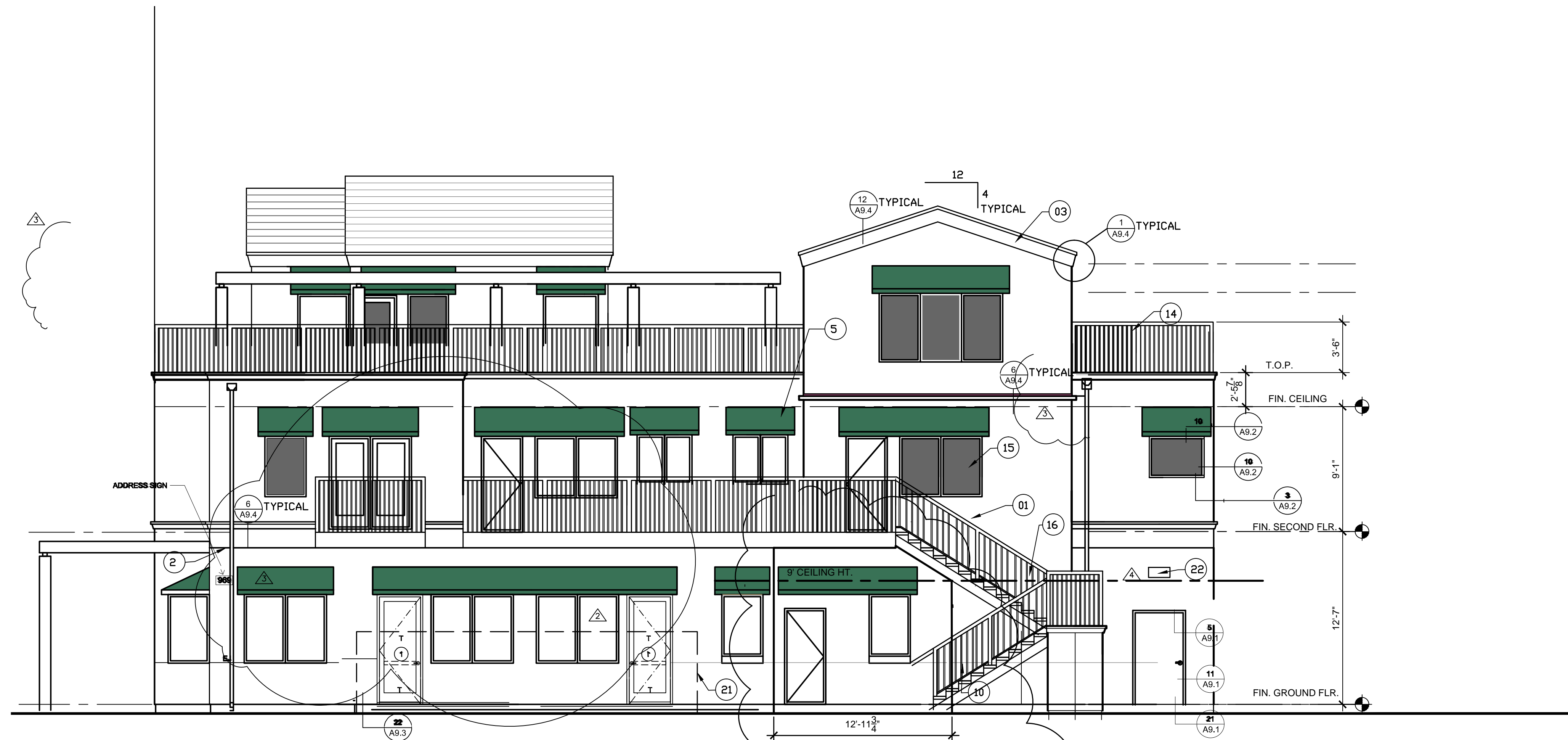
PORTER STREET ELEVATION (WEST)