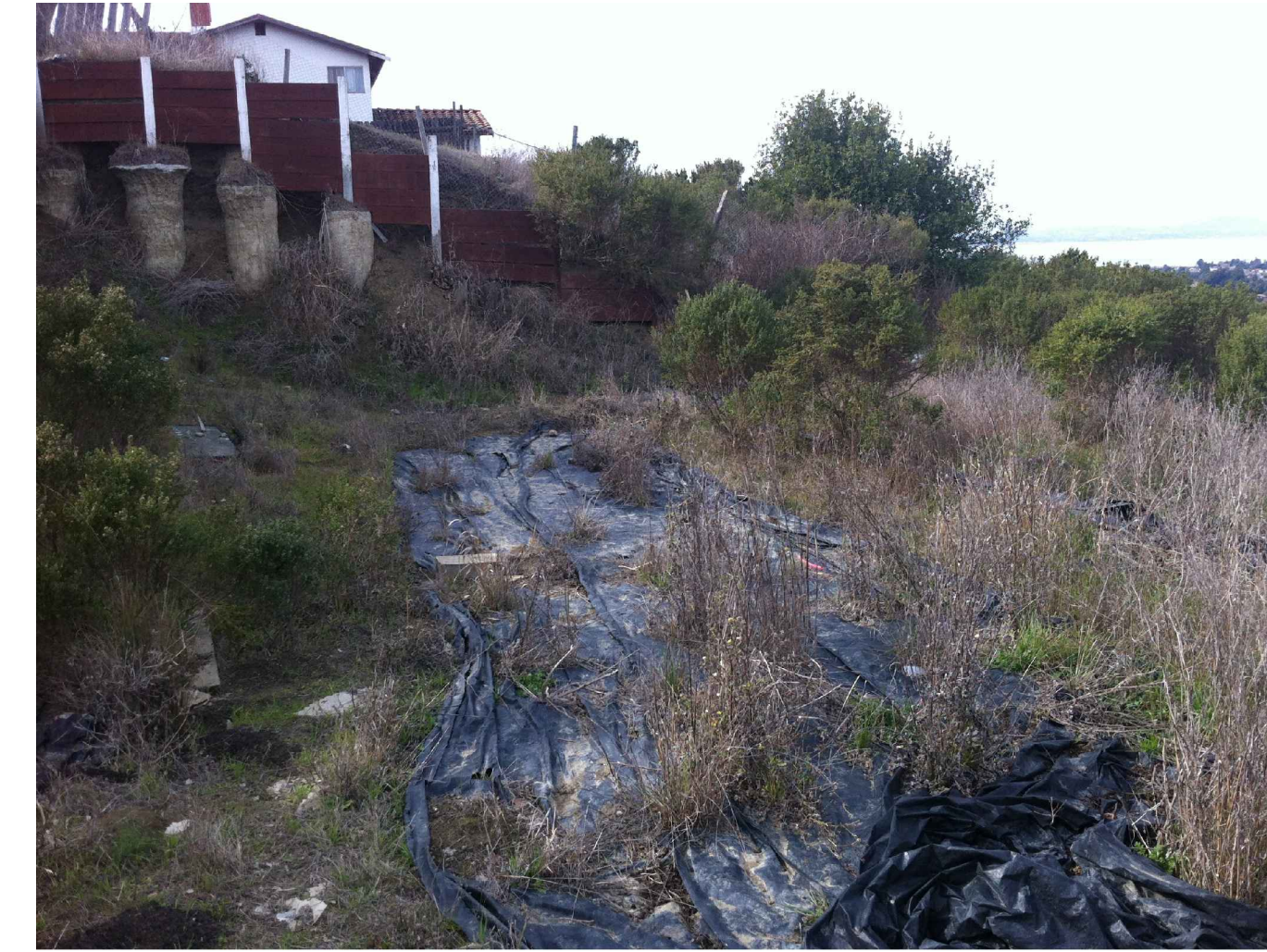
ELEVATIONS OF WALLS LOOKING SOUTHWEST