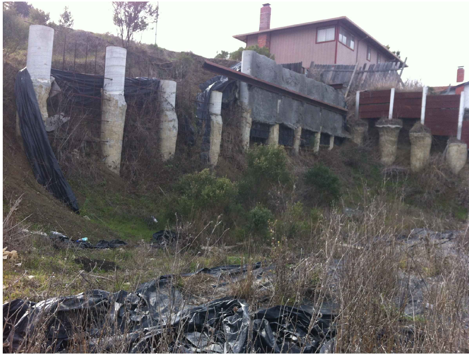
ELEVATIONS OF WALLS LOOKING SOUTHWEST