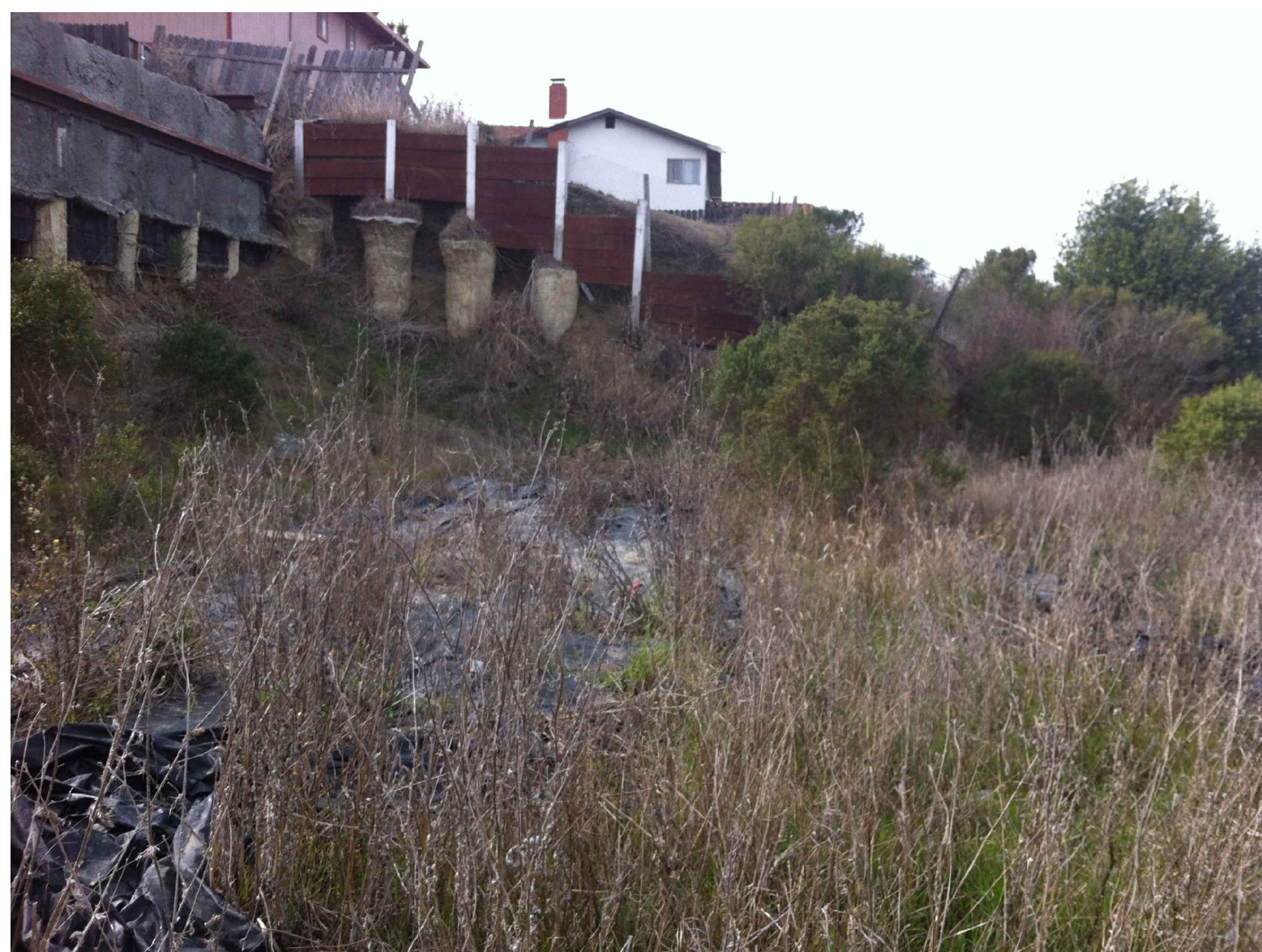
ELEVATIONS OF WALLS LOOKING SOUTHWEST