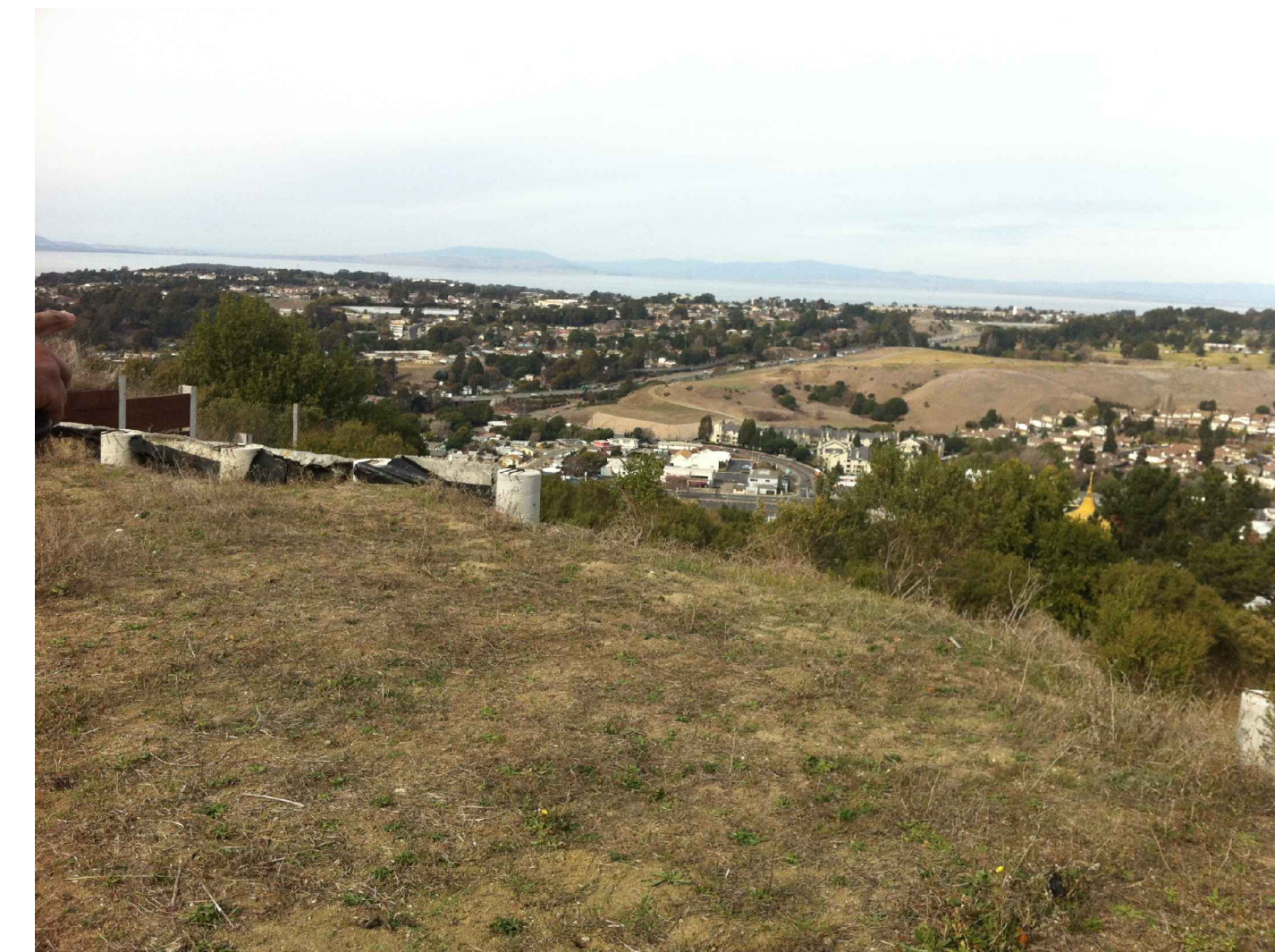
EDGE OF BUILDING PAD