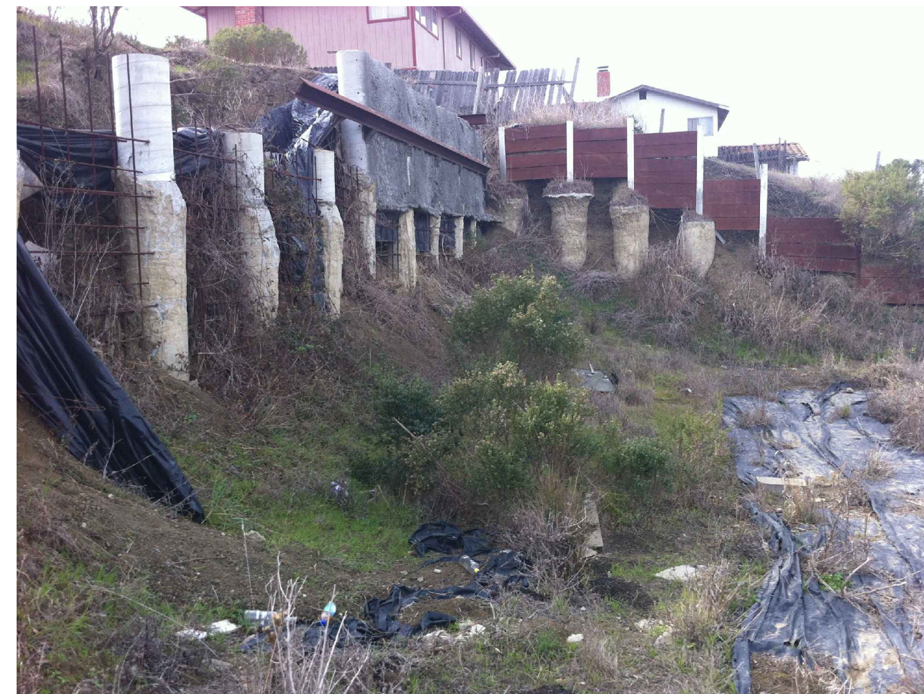
ELEVATIONS OF WALLS LOOKING SOUTHWEST