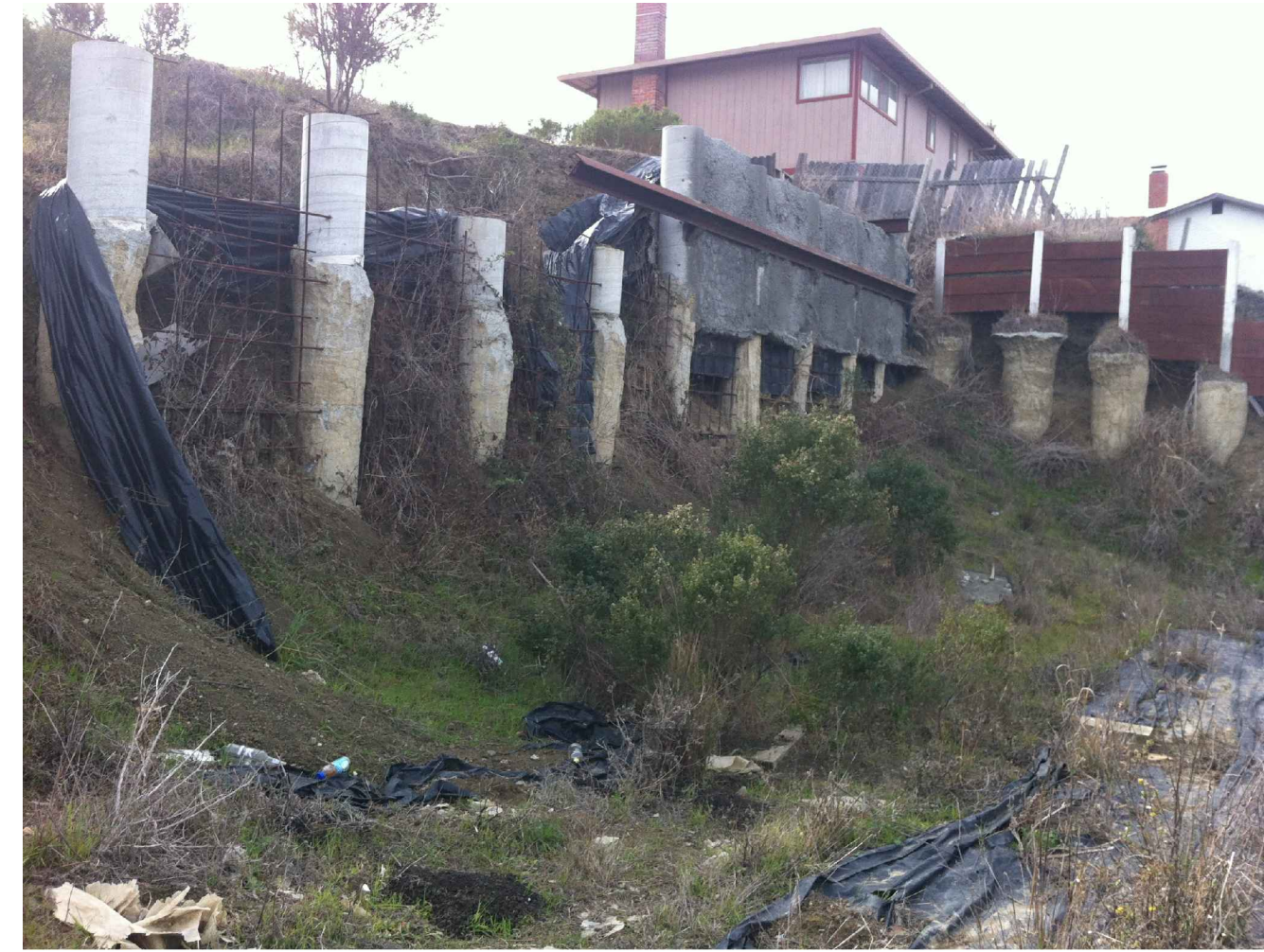
ELEVATIONS OF WALLS LOOKING SOUTHWEST